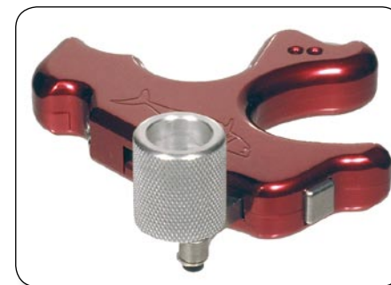
Figure 5 (Complete)

Now, turn Sear Set Screw very, very slowly counter clockwise and compress the Cocking Button. Stop turning when the Cocking button can remain compressed, unaided, as shown in Figure 4.