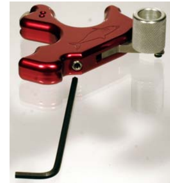
Figure 6 (Complete)