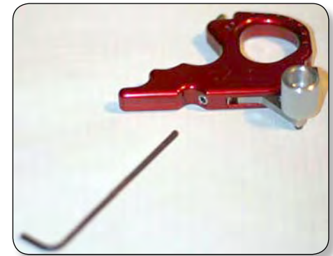
Figure 6 (Complete)